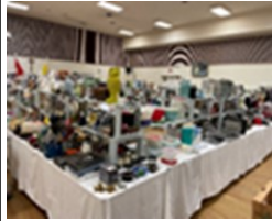
Back to School Event