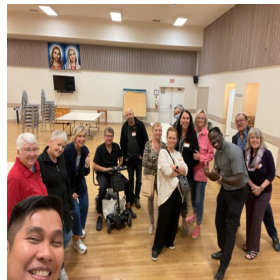
OUR ALPHA TEAM